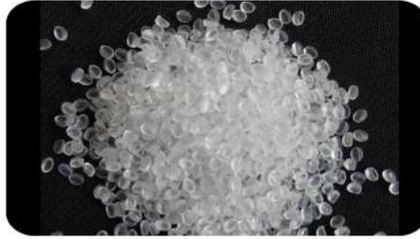
LLDPE Virgin Granuels