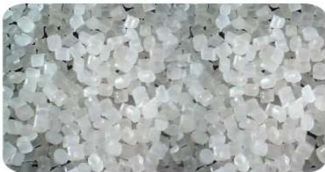
HDPE Recycle Granuels