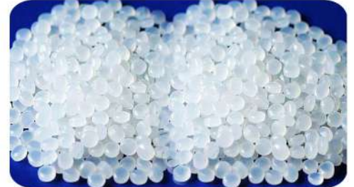
PP Virgin Granuels