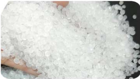
HDPE Virgin Granuels