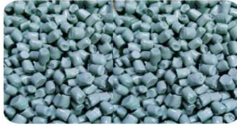
PP Recycle Granuels